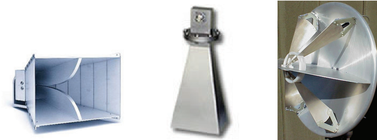
Figure 3. The ETS Lindgren (EMCO) model 3115 double-ridged horn (left), the A.H. Systems model SAS-582 standard gain horn (middle), and the Farr Research model IRA-3M (right).